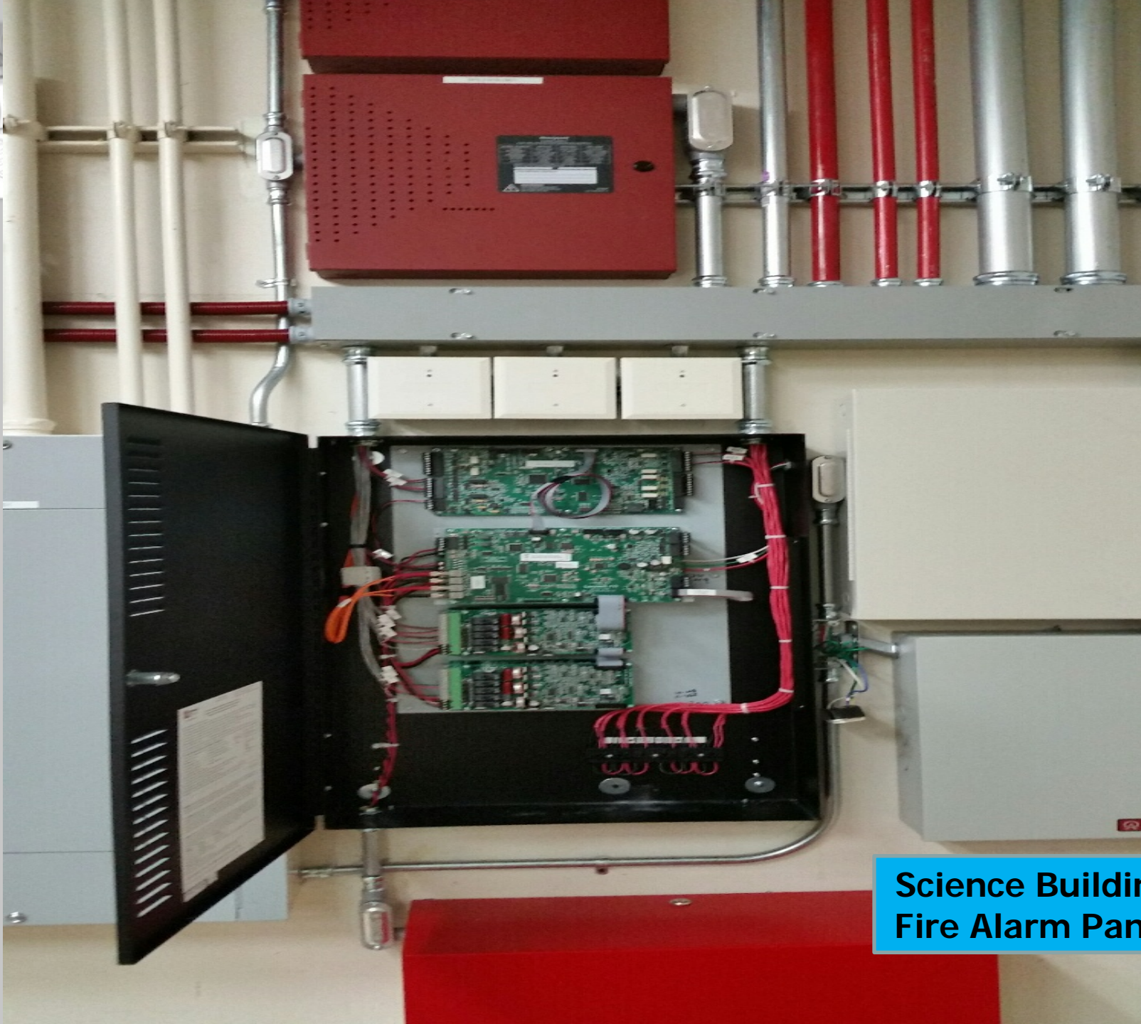
Science Building Fire Alarm Panel