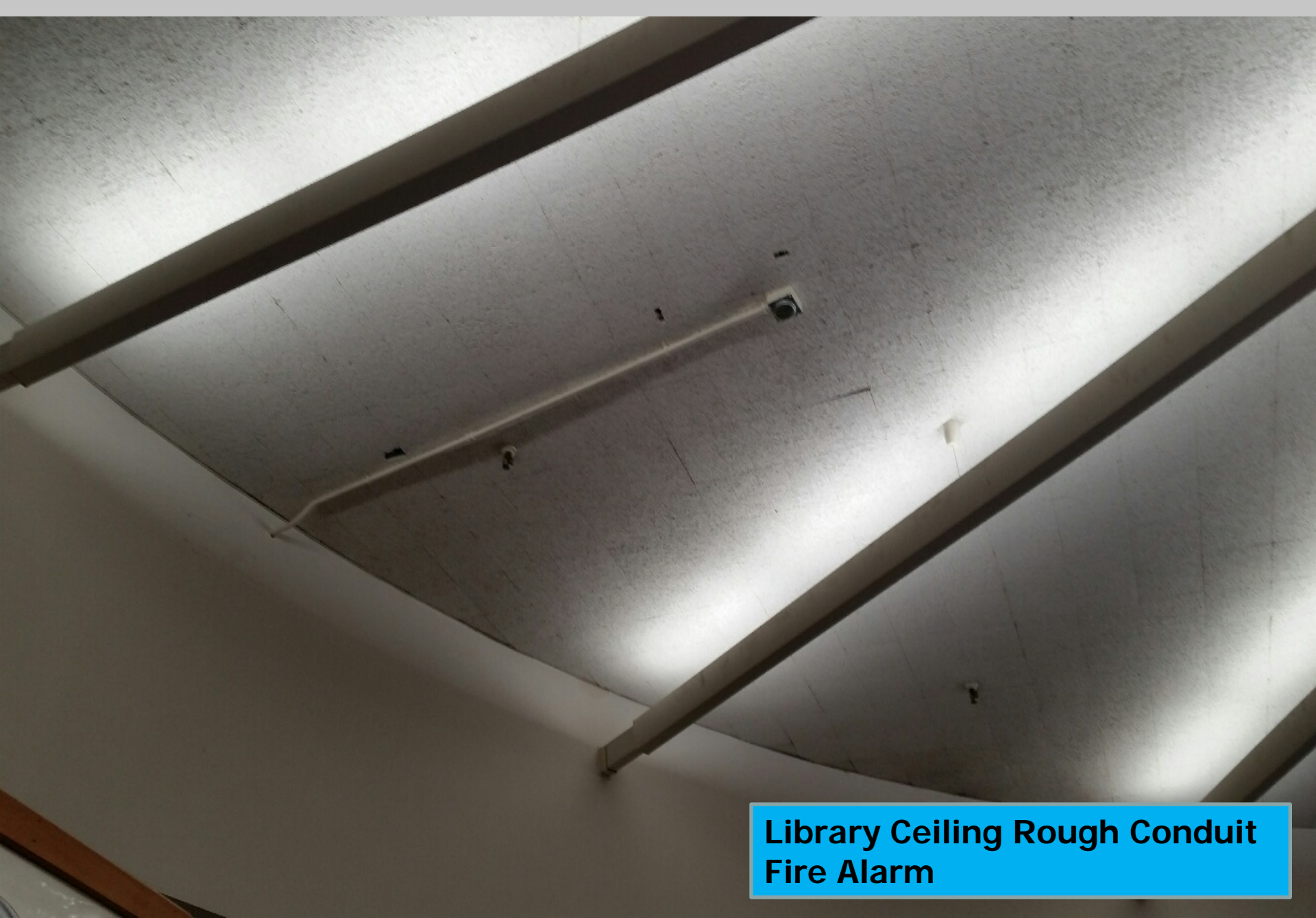
Library Ceiling Rough Conduit Fire Alarm