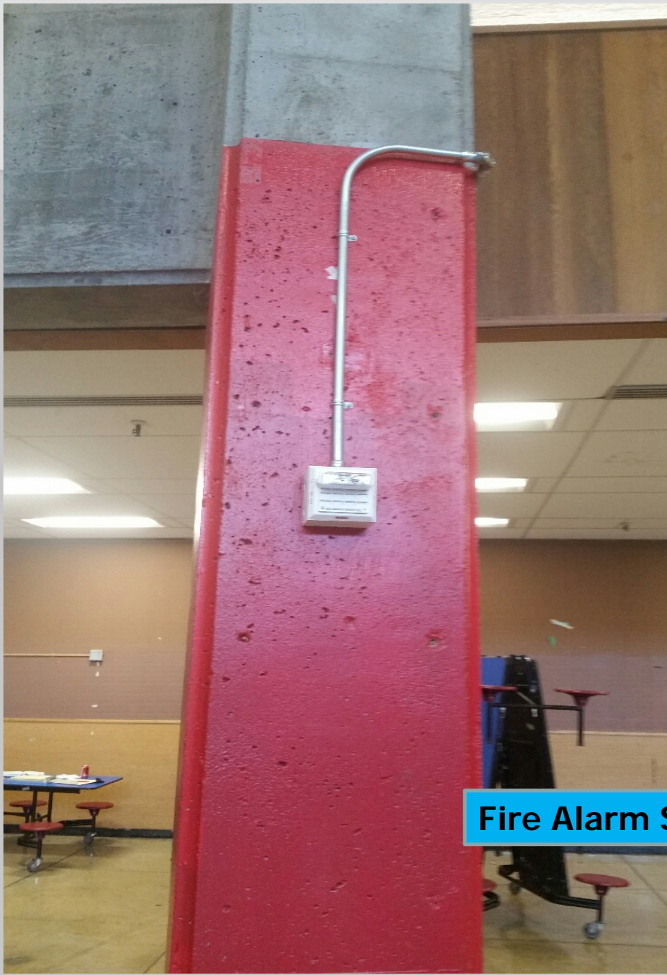
Fire Alarm Strobe Light